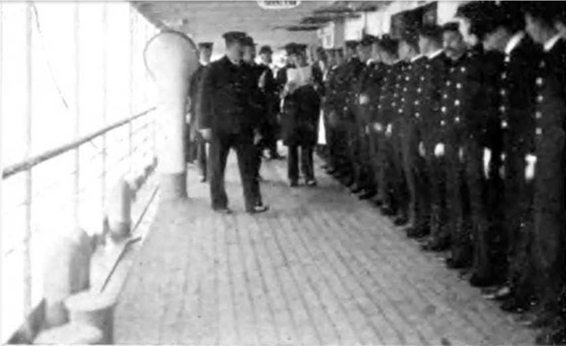
The Crew Lines Up for Inspection Before the Voyage.

When the hedges of the home farm can no longer confine the ambitions of young Giles, and he determines to seek fortune across the seas, he little knows how his decision excites the interest and solicitude of the Board of Trade.