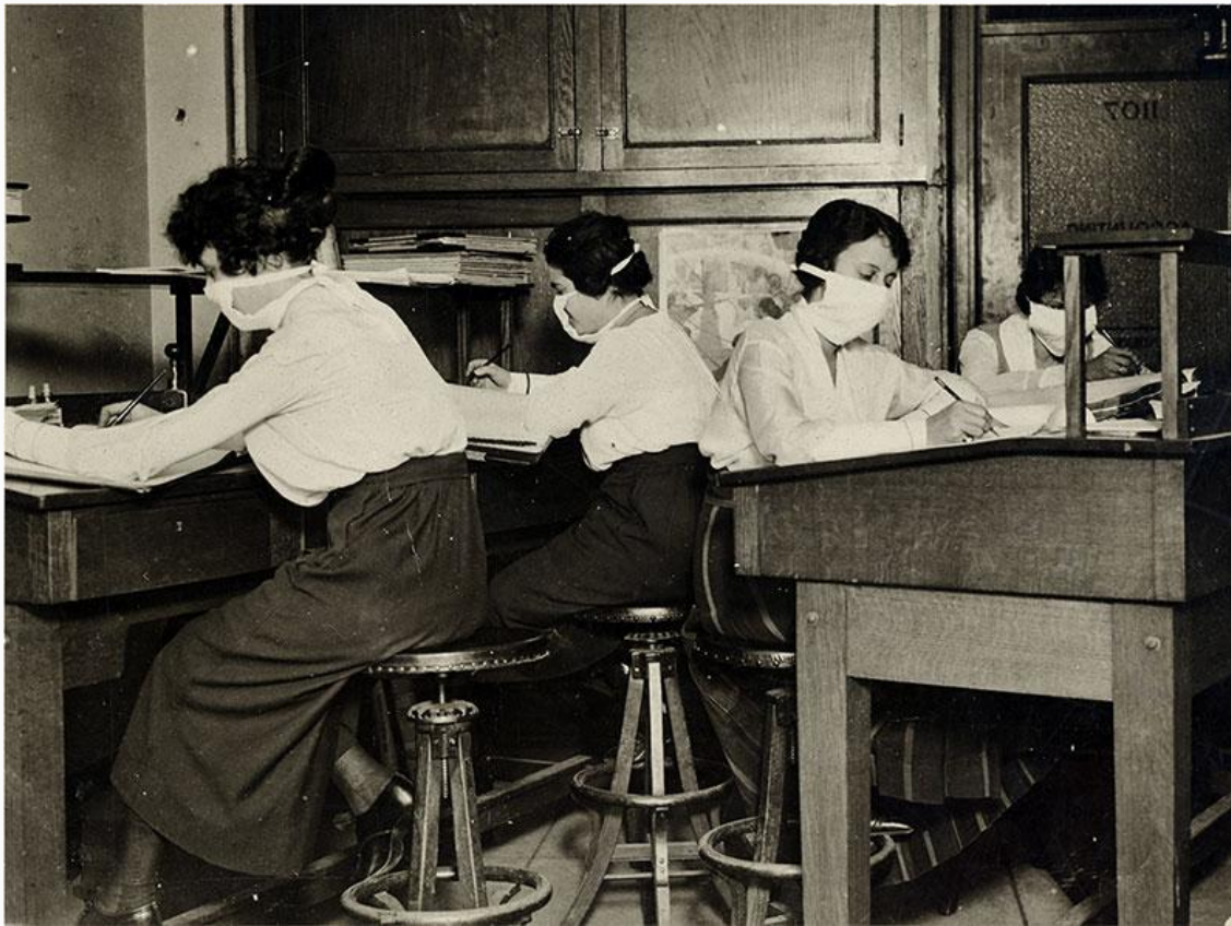
Girl Clerks in New York Work with Protective Masks, 16 October 1918.

During March, the news about COVID-19 that started in Wuhan, China, progressing to Europe, was now in the United States. In the first half of the month, we devoted much of our resources to add additional material to our website's immigration section.